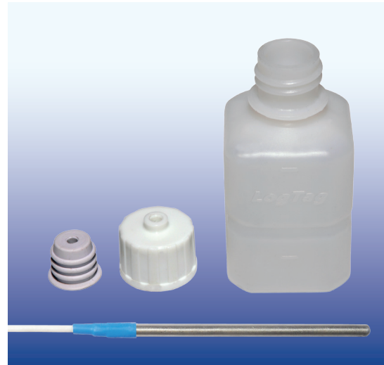
Glycol buffer (seal, cap and vial) with ST100K sensor

The glycol buffer contains three parts: the vial, the seal and the cap. To use the buffer with one of the sensors, please fill and seal the vial according to these instructions: